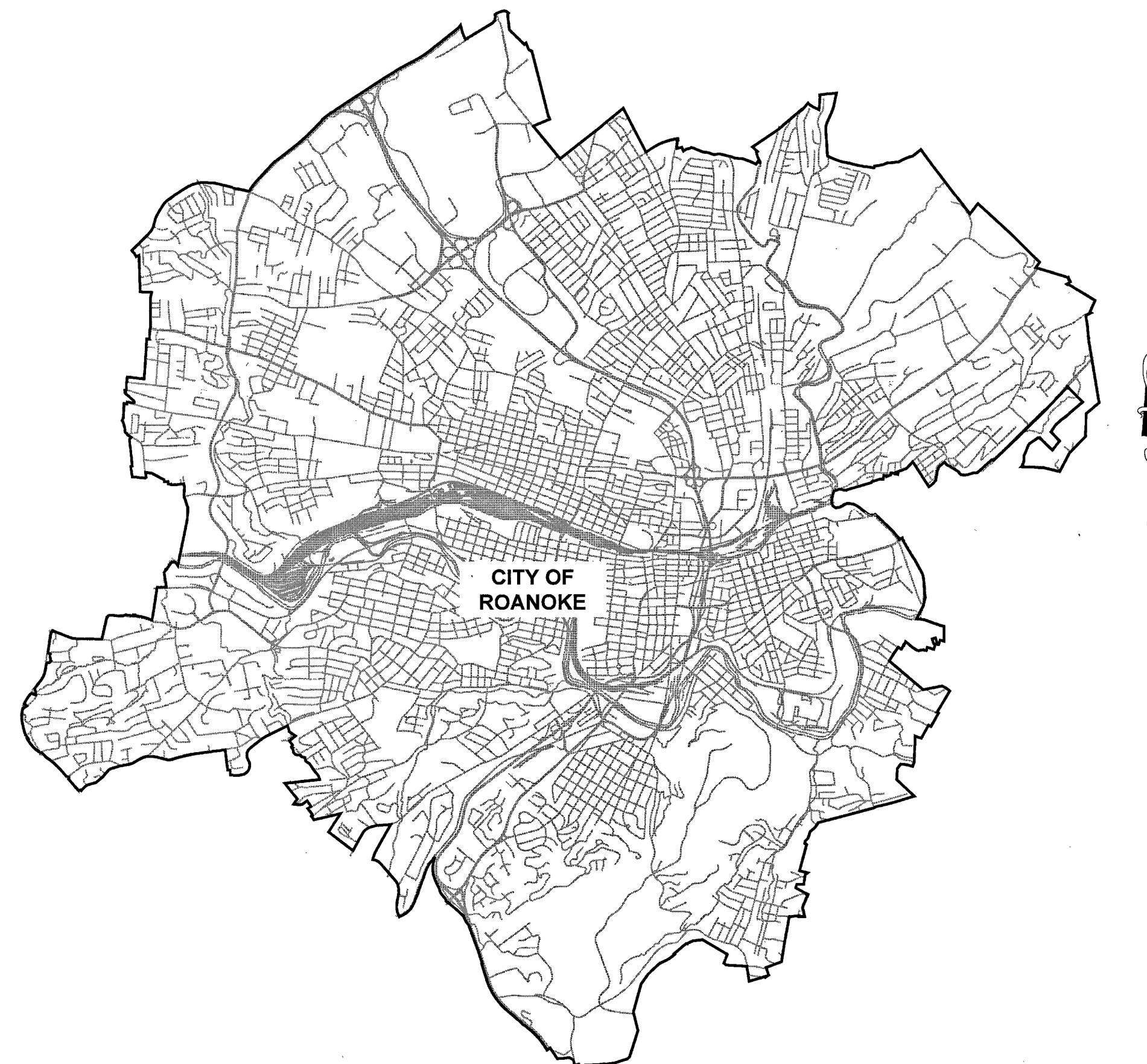
VICINITY MAP 1" = 5000'

PATTERSON AVE NORTH & SOUTH, KENWOOD BLVD, GREENBRIER AVE, EPPERLEY AVE, EMBASSY DR, SMH-07A-0005.0