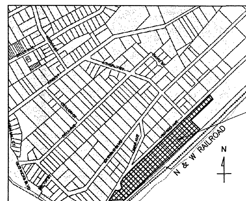
VICINITY MAP NO SCALE

ENGINEER CONTACT LMW P.C. ENGINEERING - ARCHITECTURE - SURVEYING - LANDSCAPE DESIGN CONTACT PERSON: RICHARD C. WHITE, P.E.