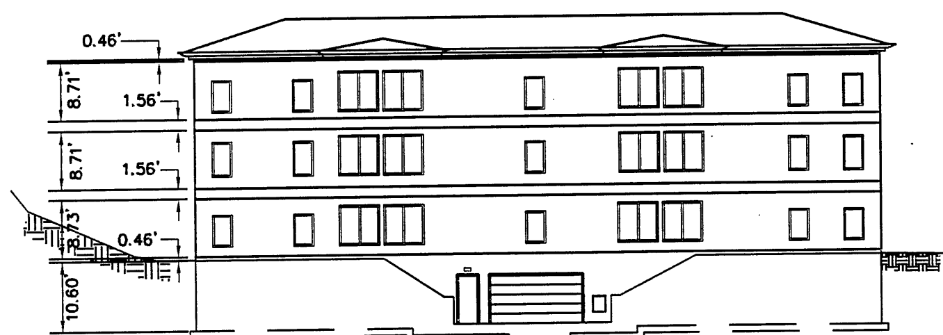
LEFT SIDE SECTION WEST VIEW

I, B. LEE HENDERSON, JR., A REGISTERED ENGINEER IN THE COMMONWEALTH OF VIRGINIA, HEREBY CERTIFY THAT THIS PLAN, EXHIBIT "A", ACCURATELY SHOWS THE UNITS DELINEATED AND COMPLIES WITH THE PROVISIONS OF SECTION 55-79.58 PARAGRAPH (B) OF CONDOMINIUM ACT. I FURTHER CERTIFY THAT UNLESS NOTED OTHERWISE ALL UNITS DEPICTED HEREON HAVE BEEN SUBSTANTIALLY COMPLETED.