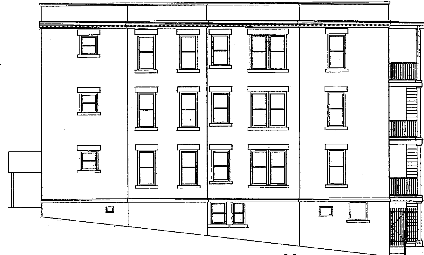
RIGHT VIEW BUILDING "B" #722