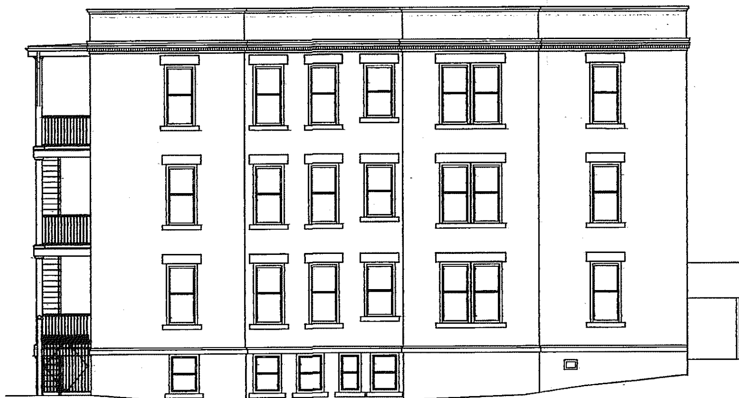
LEFT VIEW BUILDING "A" #720