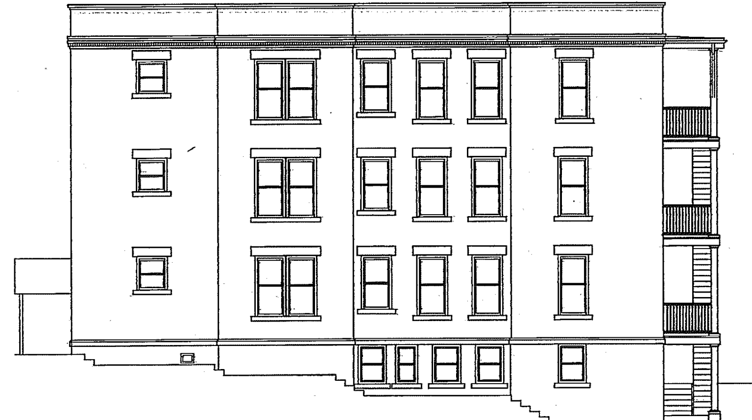
RIGHT VIEW BUILDING "A" #720