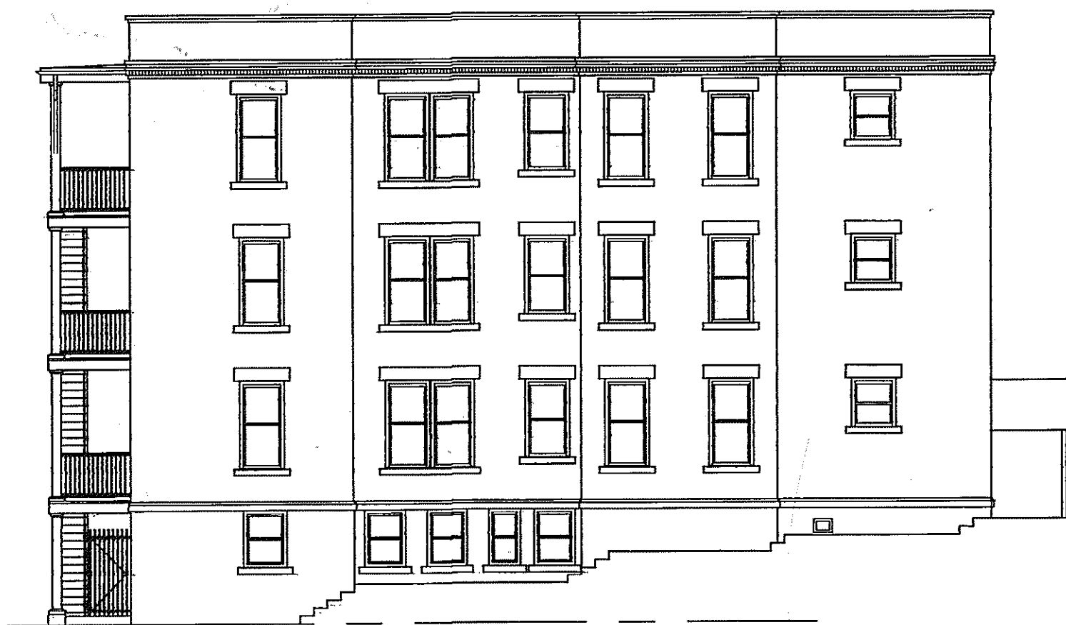
LEFT VIEW BUILDING "B" #722