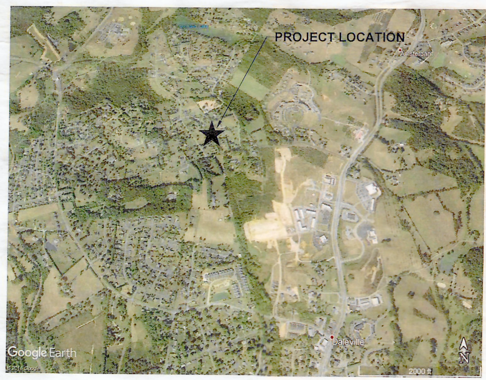
PROJECT AREA MAP N.T.S.