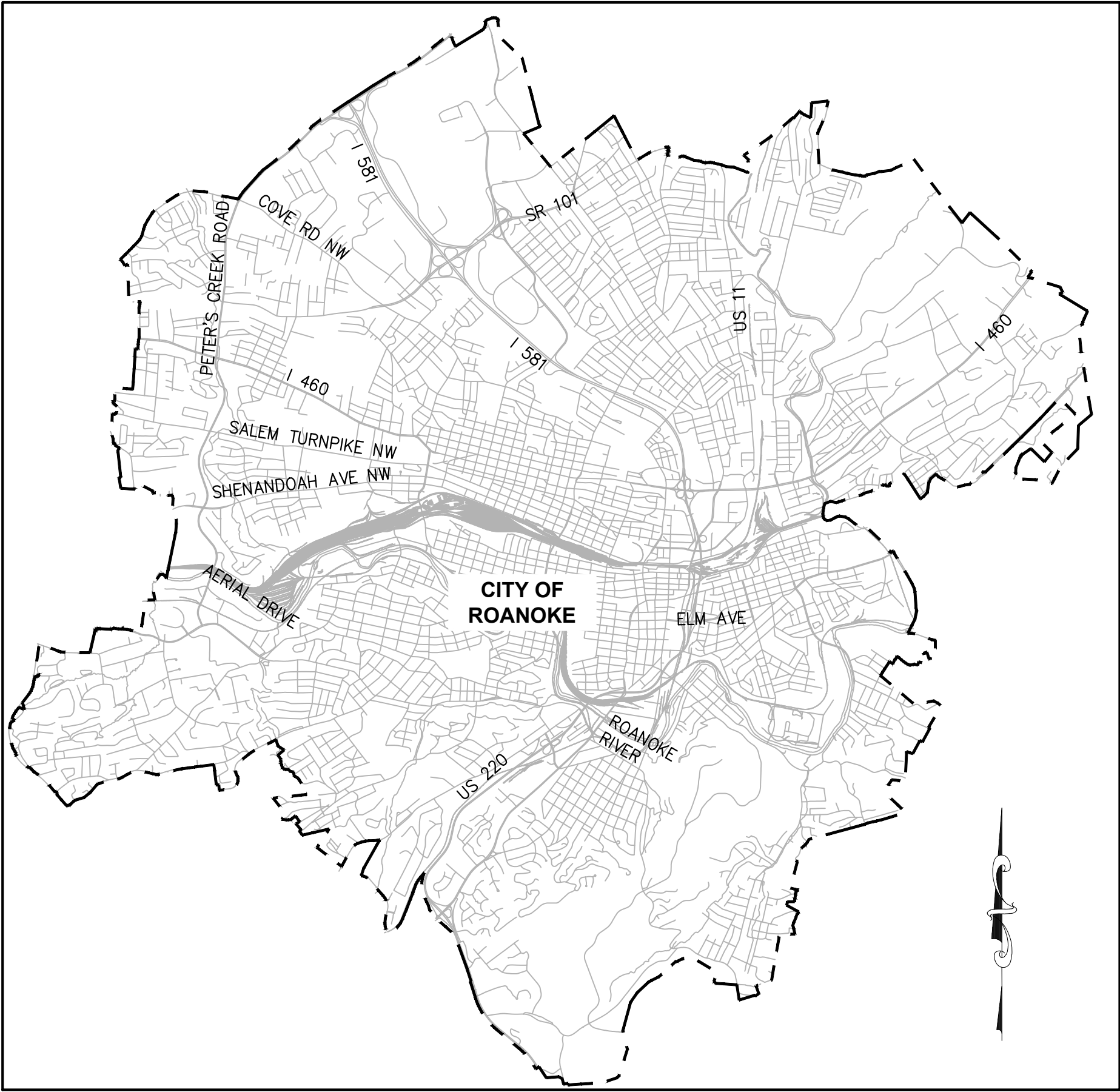
VICINITY MAP 1" = 5,000'

PREPARED FOR: WESTERN VIRGINIA WATER AUTHORITY 601 S. JEFFERSON ST ROANOKE, VA 24011 TELEPHONE: 540-853-5700 FAX: 540-283-8217